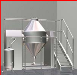
Double Cone Blender