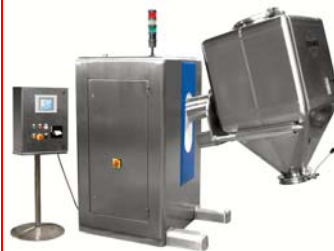
IBC and Blenders