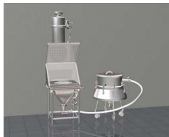
Milling and Sieving